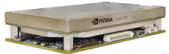
ASG008 shown paired with Jetson TX1