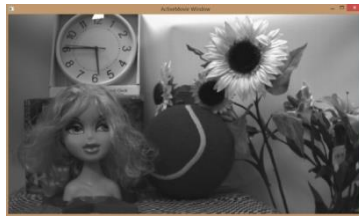
Camera Tool view mode