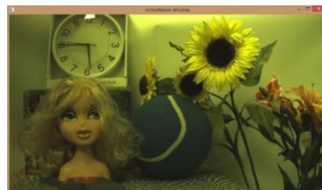
Camera Tool view mode