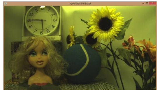
Camera Tool view mode