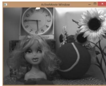
Camera Tool view mode