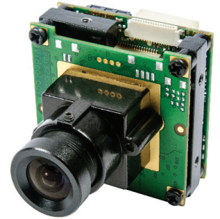
Shown with optional lens