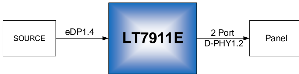
Figure 3.1 Application Diagram